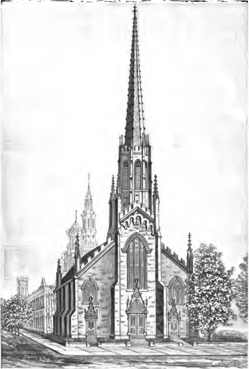
THE FOURTH EDIFICE.